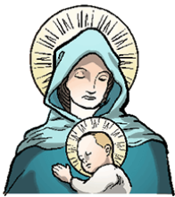
Solemnity of Mary

Looking for financial assistance with your college education? Applications are now being accepted for the 2018 Bibianne Bessette Scholarship Fund. The scholarships aid graduating high school seniors who are pursuing a college or vocational education at an accredited degree granting institution. Consideration is based on academic achievement. Applicants must complete the on-line application found at http://www.dioceseofmarquette.org/bbscholarshipink and mail an Official Transcript and ACT/SAT scores (via postal mail) to: Bessette Scholarship Fund, Diocese of Marquette, 1004 Harbor Hills Drive, Marquette, MI 49855. Applications must be received no later than March 15, 2018.